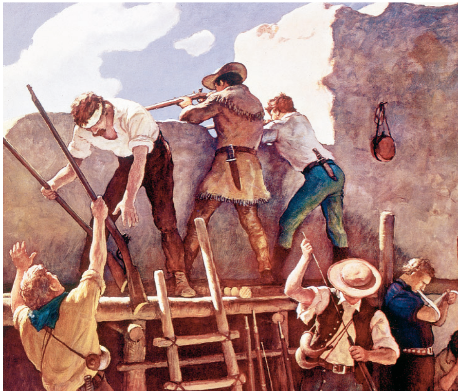
◀ Santa Anna's army met with strong resistance from the defenders of the Alamo.

Santa Anna led Mexican forces north to try to hold on to the rebellious territory. He won a few early battles, including a bitter fight at the Alamo, a mission in San Antonio. However, his fortunes changed at the Battle of San Jacinto. His troops were defeated and he was captured. Texan leader Sam Houston released Santa Anna after he promised to respect the independence of Texas. When Santa Anna returned to Mexico in 1836, he was quickly ousted from power.